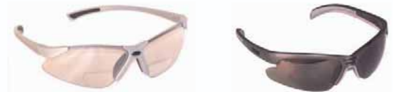
VenusX S7610Q I/O