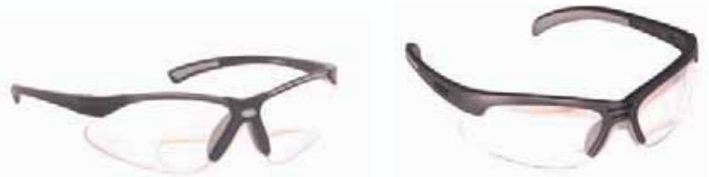
VenusX S7610Q Clear