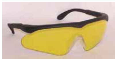
Electras II, S2613