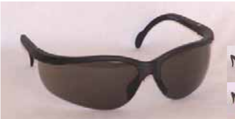
Gorgons II S55, Gorgons III S54