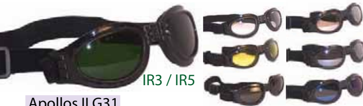
IR3 / IR5