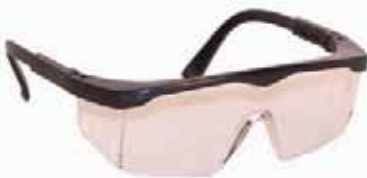
Legacy Junior S39JR