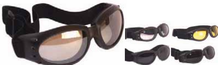
IR9 / IR11