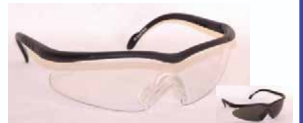
Electras S23, Electras II S26