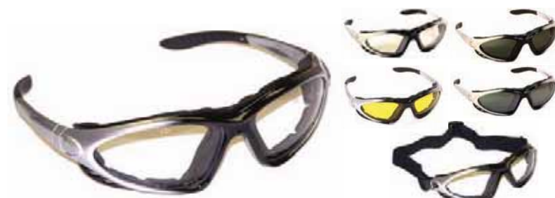
Chameleos II S37S