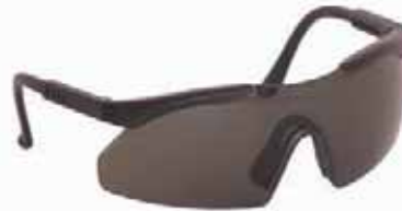
Cronos Junior S19JR