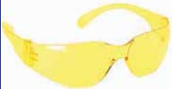
Chirons Junior S28JR

Our safety glasses come in a number of different sizes. Our junior sizes, available in the most popular lens colors, are designed for narrower faces. We also have a few styles that have a wider and deeper lens structure in order to accommodate prescription glasses. Many standard styles also have extendable and ratcheted temple arms to adjust the glasses for the best fit over your ears.